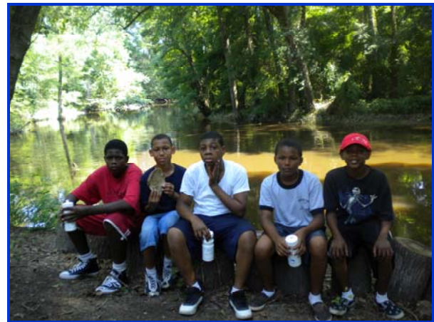
5th graders from Southeast Elementary School take a break from the activities of the day along side the Little Contentnea Creek.