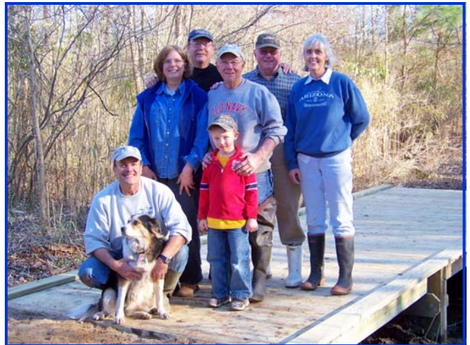
The Swansboro Gang constructs a new bridge to allow tractor access to the far reaches of The Refuge

The Feb. 20 and March 13 winter work days were productive, safe, but most of all....fun! Members of Swansboro UMC and St. Mildred's Catholic Church accepted another challenge to construct a nature trail bridge that would permit access to the back reaches of The Refuge. This is the 3rd of 4 bridges they have erected. While they were busy on the bridges, others from Institute UMC, Farmville UMC, and First Presbyterian of Greenville, made great progress on the Moses House, clearing the banks of the Contentnea Creek by the low challenge course, and turning our old graying storage shed into a bright red and white replica of a barn.